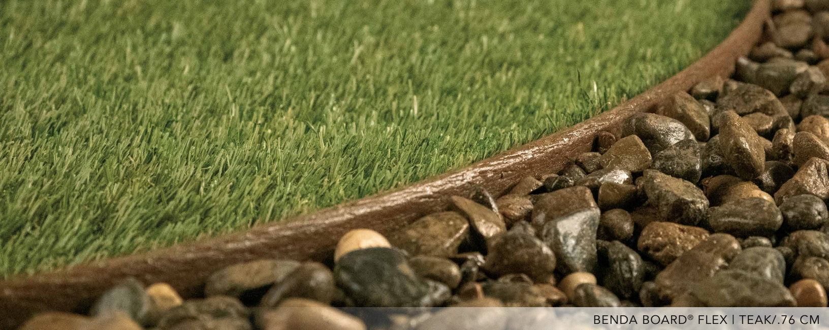
BENDA BOARD® FLEX | TEAK/.76 CM