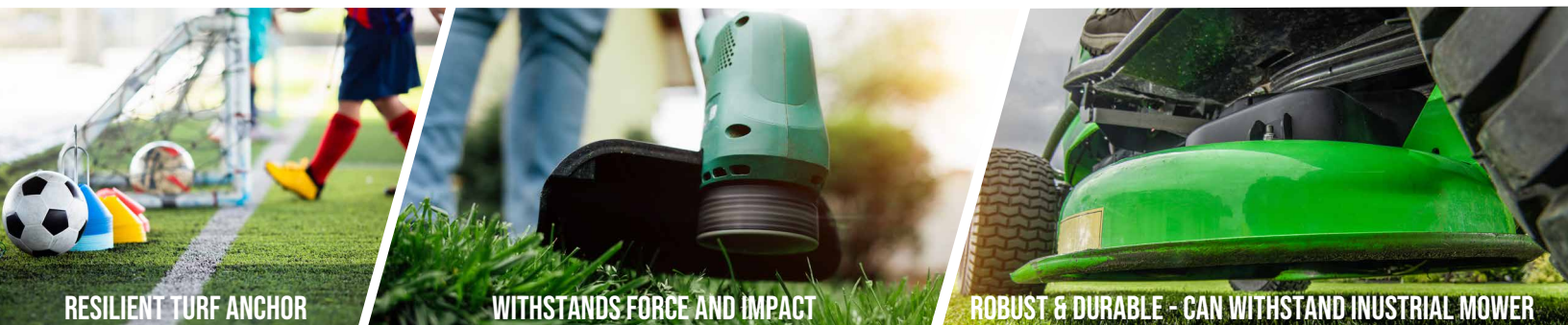
RESILIENT TURF ANCHOR

Durability You Can Trust | Built to Endure the Test of Time